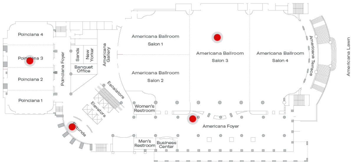
Figure 2 – Loews Second Floor

Expansive ballrooms, floor-to-ceiling windows, ocean views and ample pre-function space seamlessly blend with a curated art collection and sophisticated design to bring truly memorable events to life.