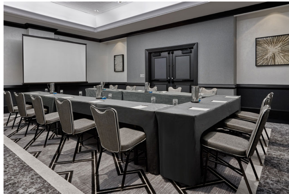
Triton Room – Typical Size, Look & Feel

The S4 Prime Sponsor Package and Requirements includes: