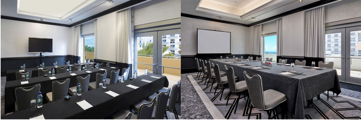
Venus Room With Private Patio