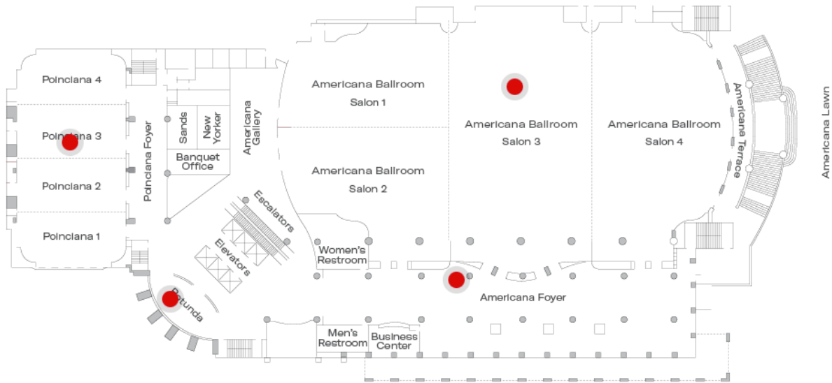
Figure 2 – Loews Second Floor